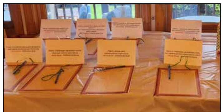
Above: Teams listen to final announcements at the start of the biennial golf tournament at the Enosburg Falls Country Club last month. Bottom pic: Lots of prizes for the silent auction filled tables at the country club in Enosburg Falls, to raise money for the Lake Carmi Community Foundation.