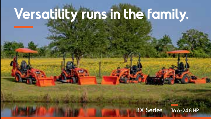
BX Series 16.6-24.8 HP