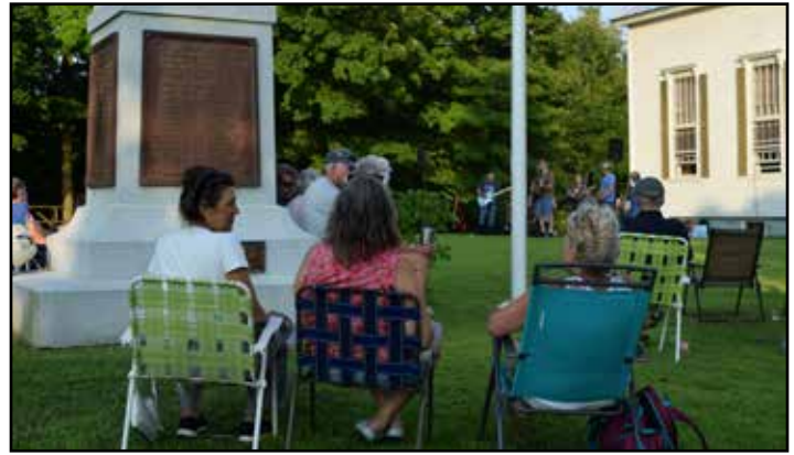
UNCLE JOHN'S BAND CONCERT

Through Aug 20, 7-8 pm. Variety of musical selections, arts and